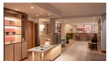
Quality Hotel Hampstead, UK