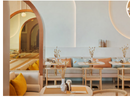
Inviting Feeling of Relaxation Using colourways with ambient lighting and layering elements.