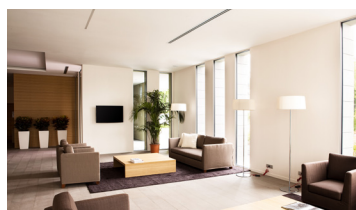
Quality Hotel San Martino, IT