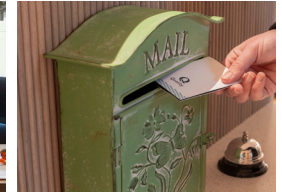
Surprising Discoveries A creative check-out mailbox and simple, easy to find wayfindings.