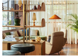
Sense of Spaciousness Multipurpose areas, using original division and display elements.

The comfortable and relaxed feeling that being at home offers is a key foundation. There are 4 key elements that need to be achieved in order to create the perfect Quality hotel by applying the following design approaches: