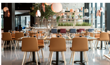
Quality Hotel Pond, NO