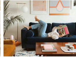
Contemporary Design Choices Design choices offering comfort, residential touches & bespoke art.