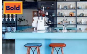
Bold High contrast colours balanced with neutrals, timber is used to bring organics to the mood.

Our vibrant design brings personality to our hotels, producing inspiring and energising casual spaces for socialising, relaxing, sleeping and working. It's an approach that offers colour-led concepts whether the focus is to make a bold, subtle or dynamic statement.