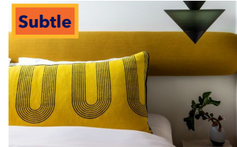
Subtle Combining two or three colours with a neutral palette will create a subtle and calming look.