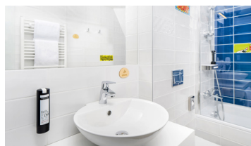
Comfort Prague City East, CZ