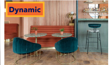
Dynamic The two most basic triadic palettes are the primary colours : red, blue and yellow.