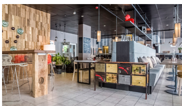
Comfort Vesterbro, DK