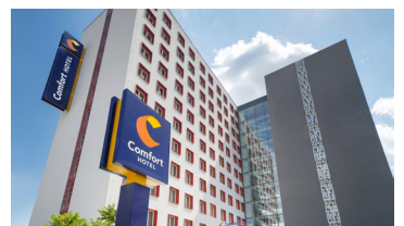
Comfort Prague City East, CZ

LET'S GET DOWN TO BUSINESS. Choice Hotels EMEA is a hotel performance enabling partner, exclusively for franchisees, offering them the opportunity to customise our services for their individual needs To find out more visit joinchoicehotels.com