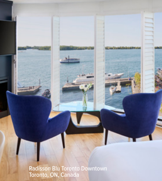
Radisson Blu Toronto Downtown Toronto, ON, Canada