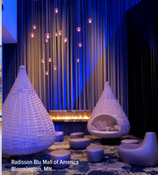
Radisson Blu Mall of America Bloomington, MN