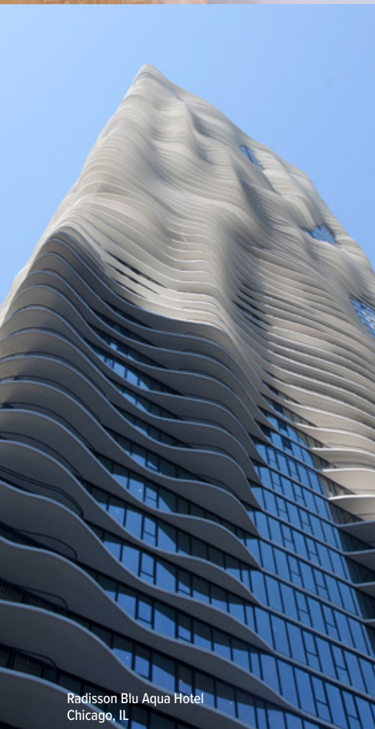
Radisson Blu Aqua Hotel Chicago, IL