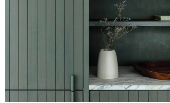
Uniformity of tone: Physical representation of natural environment - tactile, warm, muted.