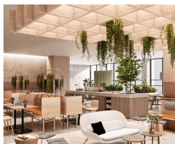
Sleep Prototype - Café Style Common Area