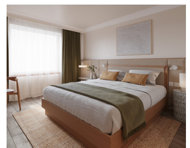
Sleep Prototype - Bedroom