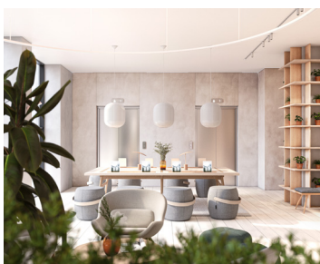
Sleep Prototype - Welcome Area