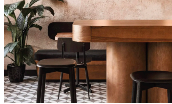
General styling: Simplicity with feature materials used in a considered way to obtain maximum impact.

Sleep's design is Inspired by Nature, balancing a calming restorative ambience with uplifting energy. This enhances our guests' sense of escape, and ensures they feel uplifted and well-rested, supported by a great nights' sleep.